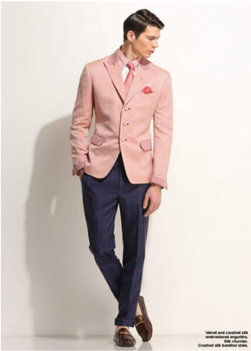
Vivret and crushed silk embroidered angarkha. Silk churidar. Crushed silk bandhni stole.