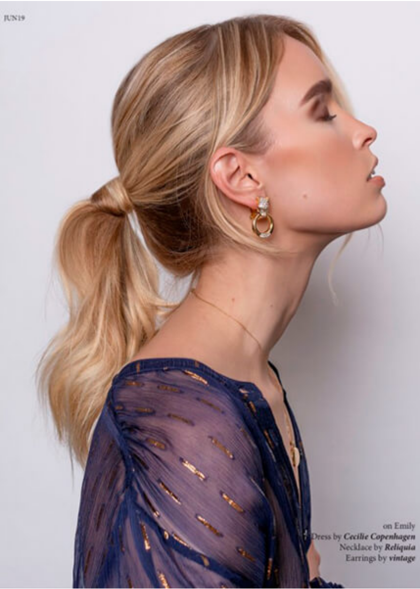
on Emily Dress by Cecilie Copenhagen Necklace by Reliquia Earrings by vintage