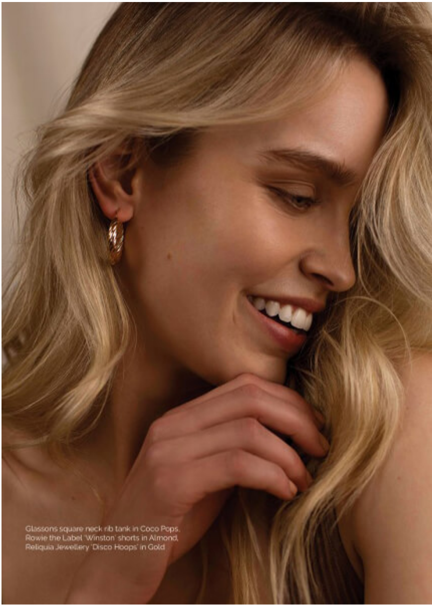
Glassons square neck rib tank in Coco Pops, Rowie the Label 'Winston' shorts in Almond, Reliquia Jewellery 'Disco Hoops' in Gold.